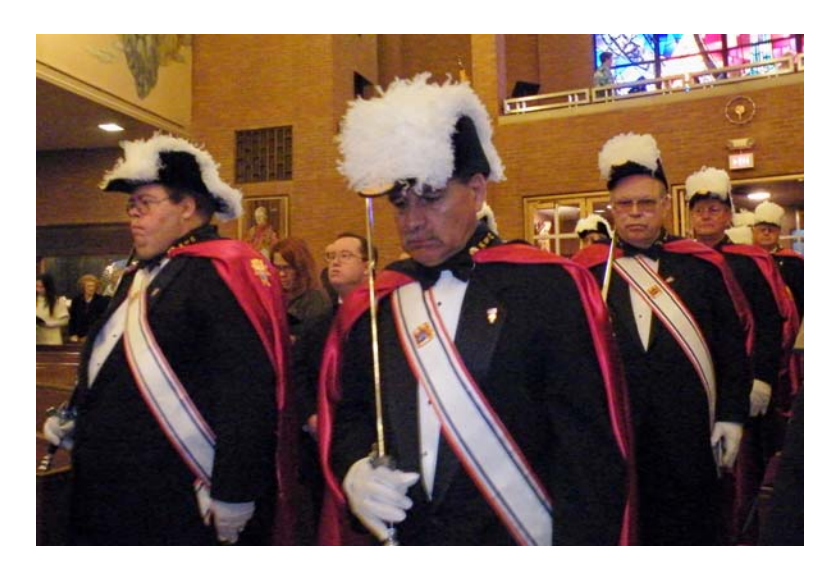
Memorial Mass at Holy Family

Merry Christmas and a very prosperous New Year to all!